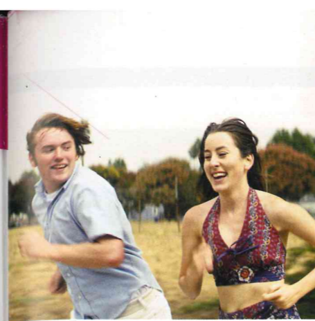
In copertina: Licorice Pizza di Paul Thomas Anderson

Distribuzione Librerie ed Edicole IPS Italia Srl (www.ips-italia.it) Via Campania 12 - 20098 San Giuliano Milanese (MI) N° Verde 800.827.112 (info@ips-italia.it)